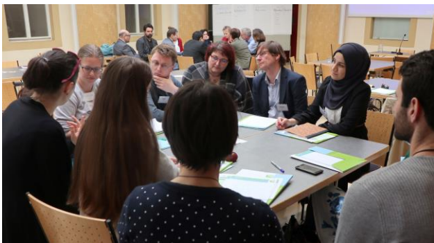
International discussions on diversity in the classroom